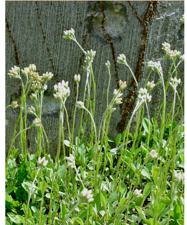
Field pussytoes, Antennaria neglecta

For a living landscape, plant local natives.